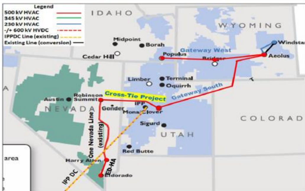
Figure 1: Cross-Tie Project Overview {Subject to change based on Sponsor's review}

received federal approval in a Record of Decision published in 1994 but was not constructed. Further, the project would be subject to the state approval processes applicable for Nevada and Utah. In any event, as the project is anticipated to follow existing transmission line corridors, TransCanyon believes that the risk of failing to obtain necessary administrative approval is considered minimal to moderate. According to TransCanyon, the project is expected to be in-service by 12/31/2024.